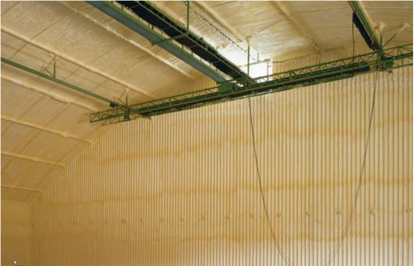
△▷ This 16,000 m 2 grain store in Essen, Oldenburg, with an external steel skeleton construction is thermally insulated from the inside and made airtight: with Elastopor H.