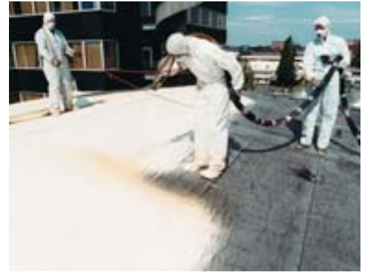
◁△ Jointless insulation and sealing with Elastopor H for buildings old and new.